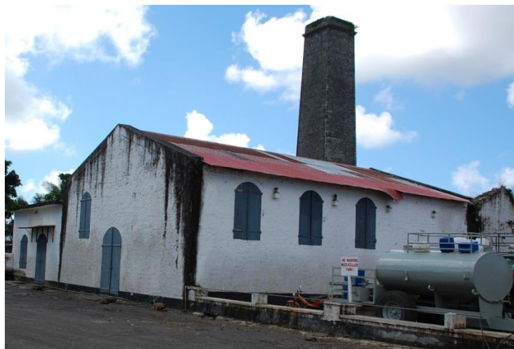
Fig 16.Remains of Sugar Factory in 2009