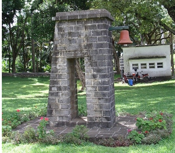
Fig 17.Bell

3. A big bell can also be found in the yard. In the old days, the bell was used to inform people about time, as long ago there was no personal clock.