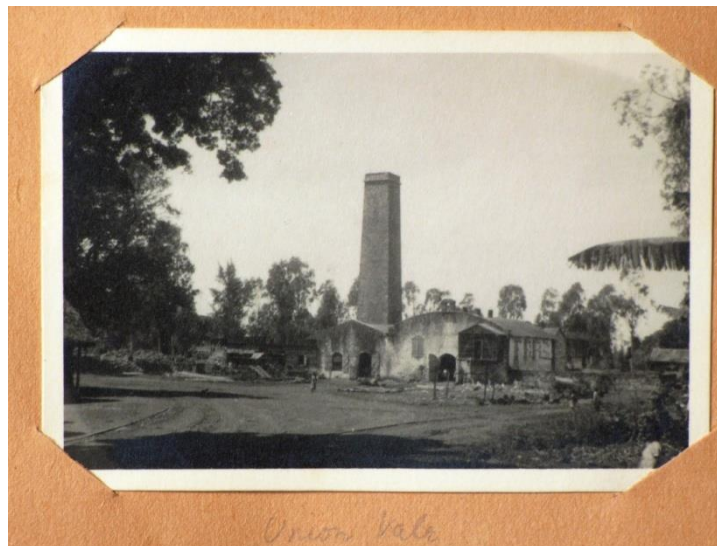
Fig 13. Union Vale Sugar Estate