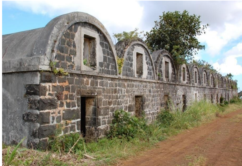
Fig 3. The Old Labourers' Quarters of Trianon in 2009