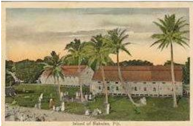
Figure 9: Immigration Depot and Quarantine Station, Nukulau Island, Fiji, c.1900