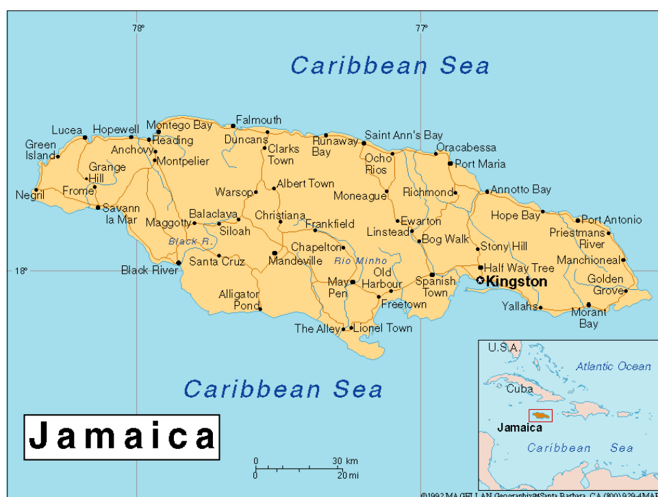
Figure 7: map of Jamaica

In Jamaica, the main landing place was located along the coast of Old Harbour, a town in the South of the country. In 1845, the first group of 261 Indian indentured people landed at there. 9 However Kingston Harbour was also used as a landing place as in the 1880s, a group of 680 Chinese immigrants including 501 men, 105 women, 54 boys and 17 girls were docked in Kingston Harbour. 10