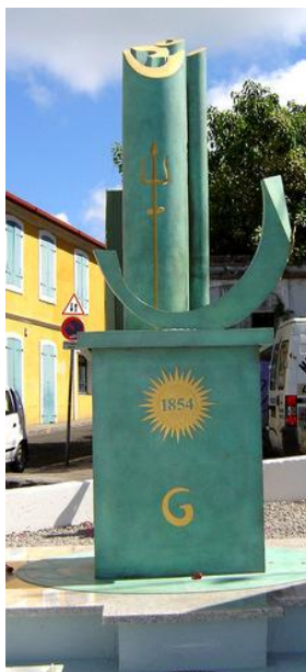
Figure 11: Monument erected in Guadeloupe.