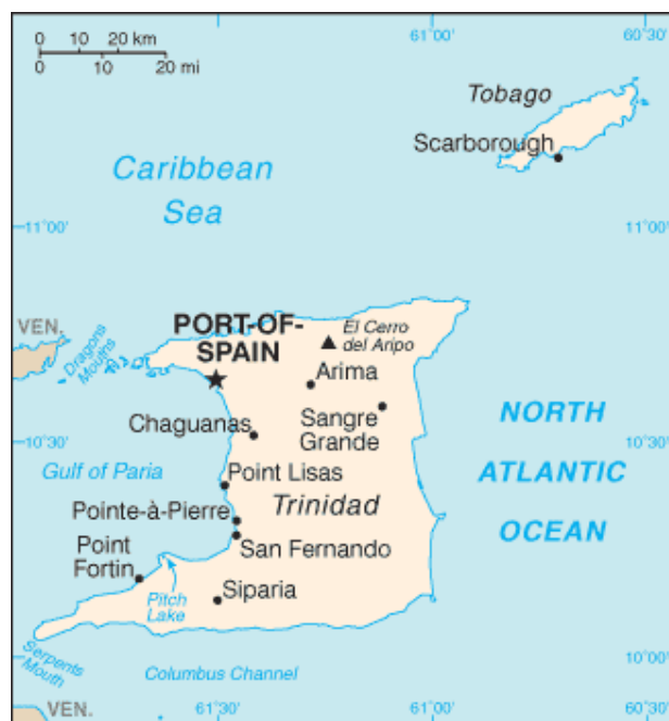
Figure 4: Map of Trinidad showing Port of Spain

Nelson Island is one of the Five Islands which lie west of Port of Spain in the Gulf of Paria. The island is famous as the disembarkation point and quarantine station for indentured immigrants to Trinidad and Tobago in the nineteenth and early twentieth century. 4 On the arrival of the immigrant ship at Nelson Island, the Protector of Immigrants proceeded to the inspection on