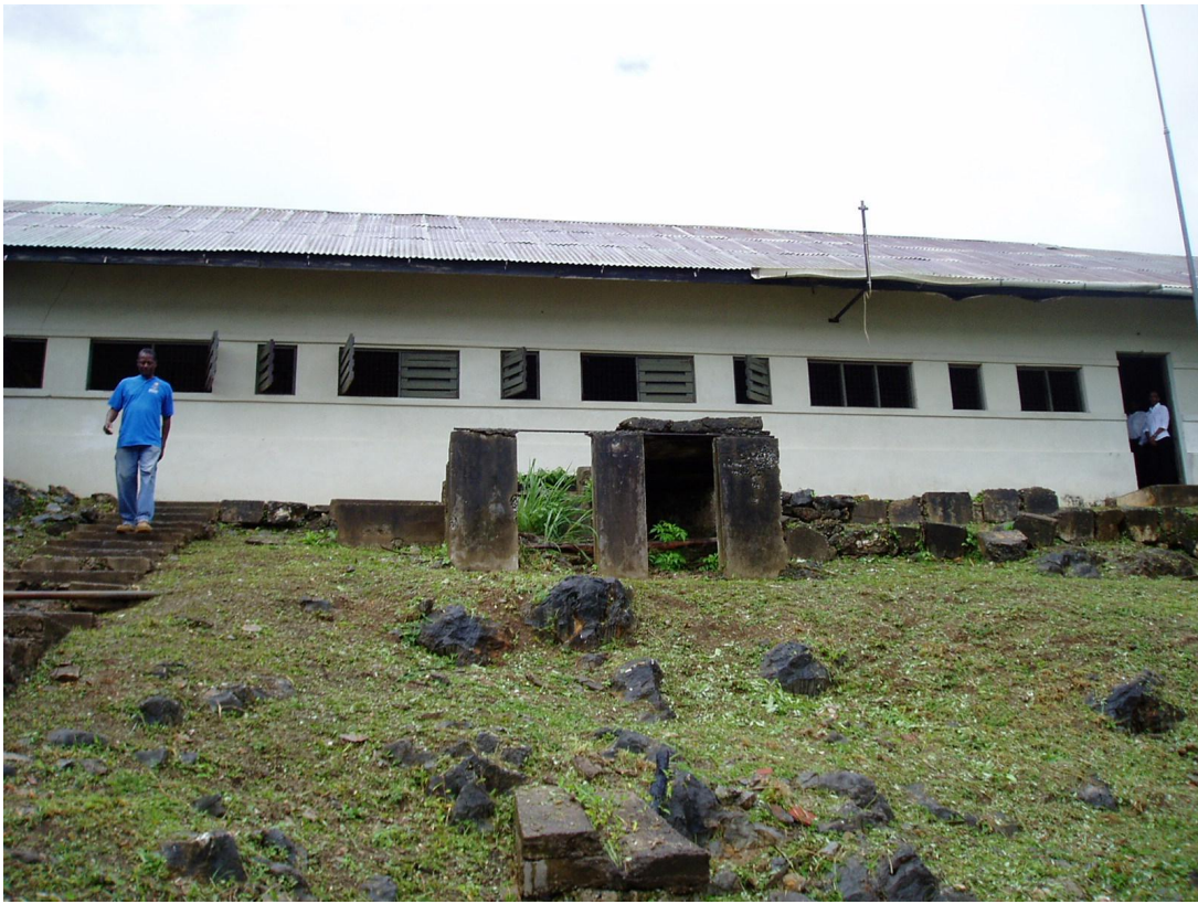
Figure 6: The site of Nelson Island