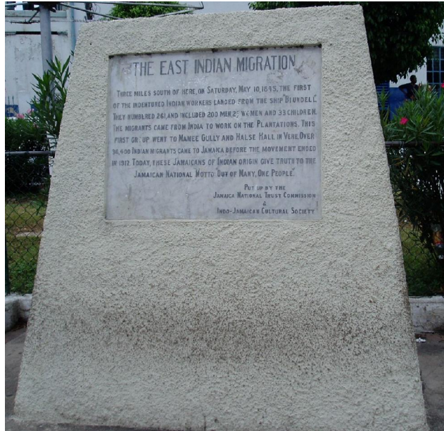
Figure 8: Monument to commemorate the arrival of Indian indentured labourers in Jamaica

descendants of Indian Immigrants, to commemorate the arrival of their forbears.