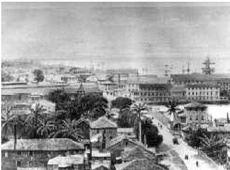
Figure 3: The Cluster of Wooden Buildings in the Foreground with coconut trees on its side is the Immigration Depot on Kingston Street in Georgetown, c.1890s.

On the site there are remains of the wharf where the vessels landed, the sugar factory and the train lines which transported the cane from the fields to the factory. There are also indications of where the manager's house and a small hospital were located. 3