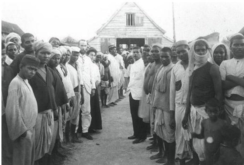
Figure 15: Picture of Indian Indentured Labourers at the Immigration Depot in Paramaribo, Suriname , c.1905

The Immigration Depot was located in Paramaribo but the building has not survived. During the 100th commemoration of the arrival of the first Indian indentured labourers a monument representing a model of the sailing ship Lala Rookh , was unveiled along the Saramaca River in Groningen. 22