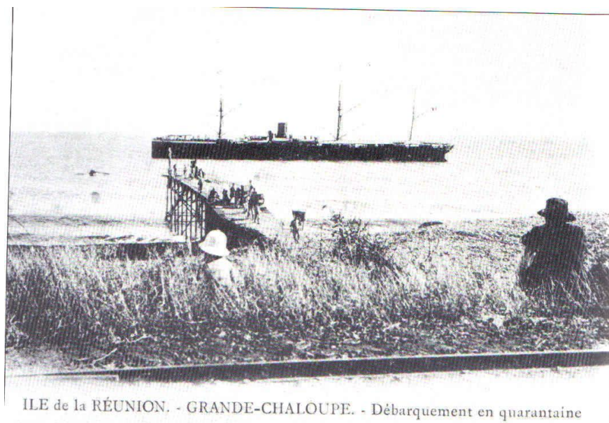
Figure 13: Quarantine Station in Grande Chaloupe – Réunion