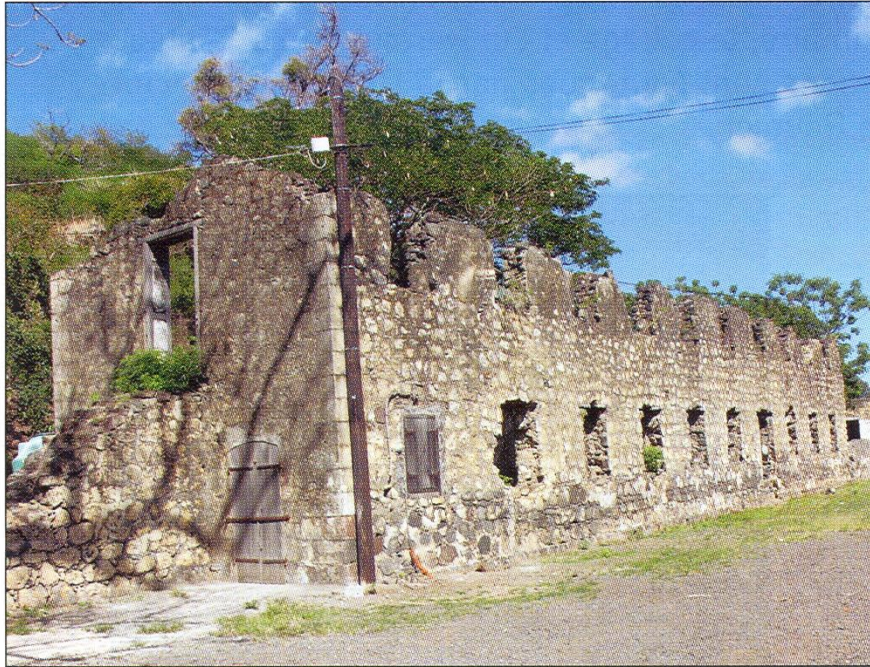
Figure 14: The Lazaret found at Grande Chaloupe.

restoration works on the abandoned buildings, for their re-use as a cultural resource and place of remembrance. 20 The Immigration Depot of St Denis has not survived 21