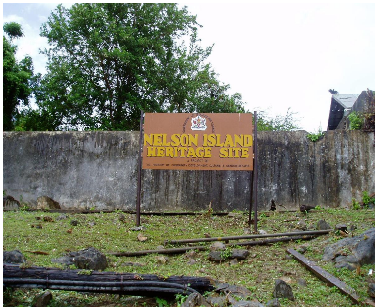
Figure 5: Panel indicating Nelson Island as a Heritage site

Trinidad 7 . The building was declared a National Monument. From information gathered recently, it seems that the Trinidadian Government has a plan to renovate and convert the site into an interpretation centre for the history of Trinidad. 8