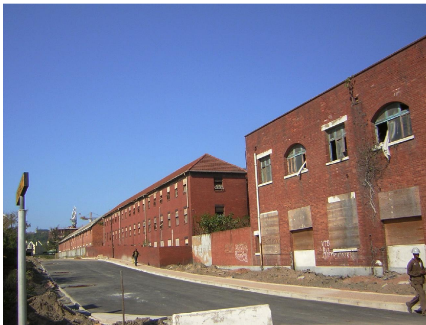
Figure 10: a structure which is possibly a Quarantine Station in Durban

South Africa, especially the province of Kwazulu/Natal was also a large recipient of indentured labourers. The Immigration Depot was located in Durban. According to South African historians, 13 the Immigration Depot no longer exists. In light with information obtained recently, it was confirmed that one structure which was possibly used as a quarantine station for indentured labourers, still exists.