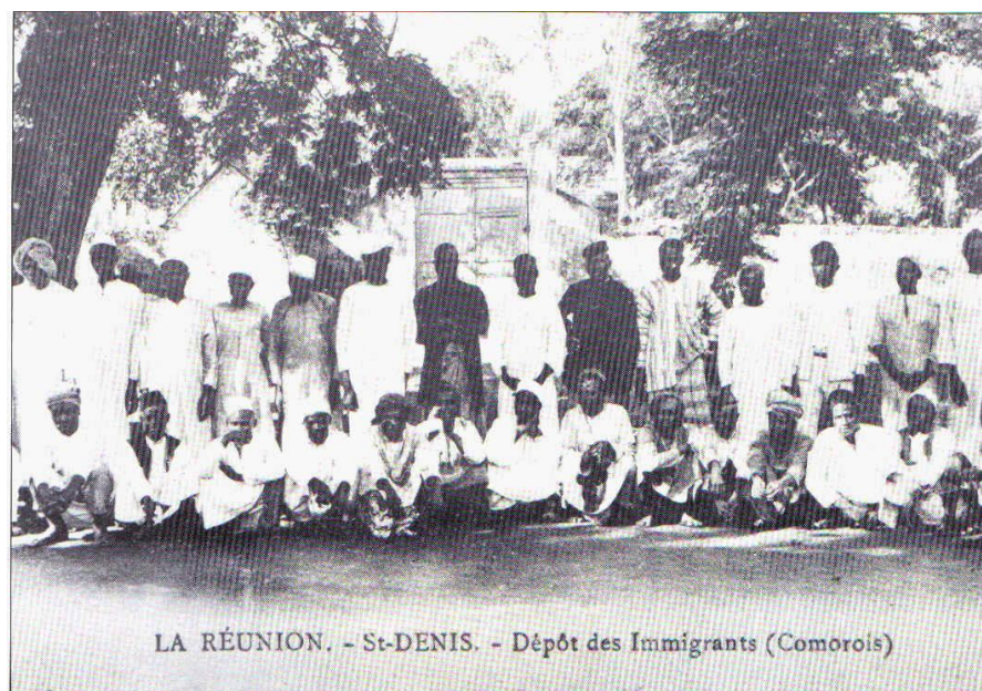
Figure 12 Immigration Depot in Réunion