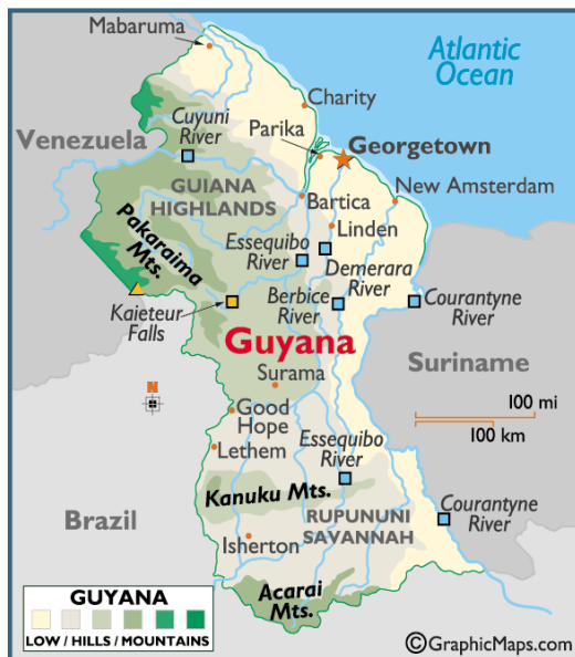
Figure 1: Map of Guyana showing location of Georgetown and Berbice River