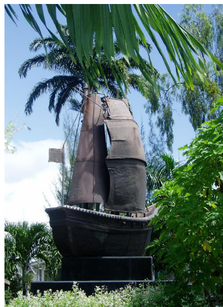
Figure 2: The Indian Heritage Monument on Camp Street Georgetown, commemorating the arrival of Indian indentured labourers in Guyana

Guyana was the second largest importer of indentured labourers after Mauritius. The main immigration depot was located at Georgetown but there were other landing places along Berbice River. Site visit in 2004 and information collected from local people confirmed that the depot no longer exists.