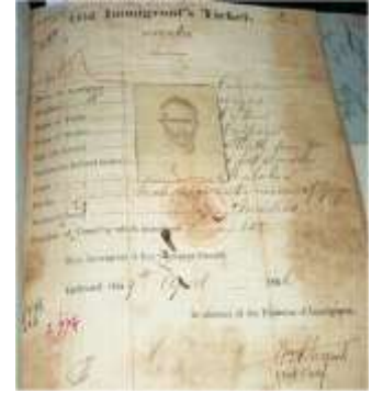
2- Immigrant ticket

2. Form a sentence with the words below. ( Write the sentence on the dotted line. )