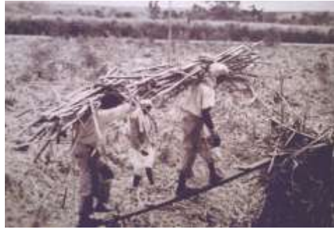
3- Work in sugar cane fields