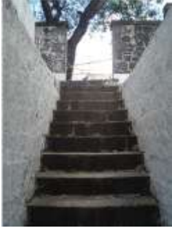
1- The steps of Aapravasi Ghat Immigration Depot

1. Place the pictures in the right chronological order.